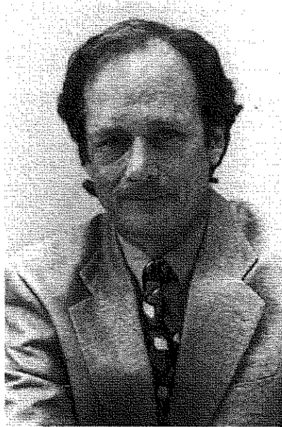
Edward L. Deci